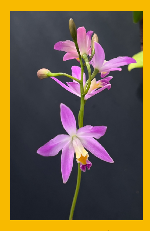
C. longipes 'Soft Touch' AM/AOS

Orchid Odyssey San Diego Zoo sandiegozoo.org