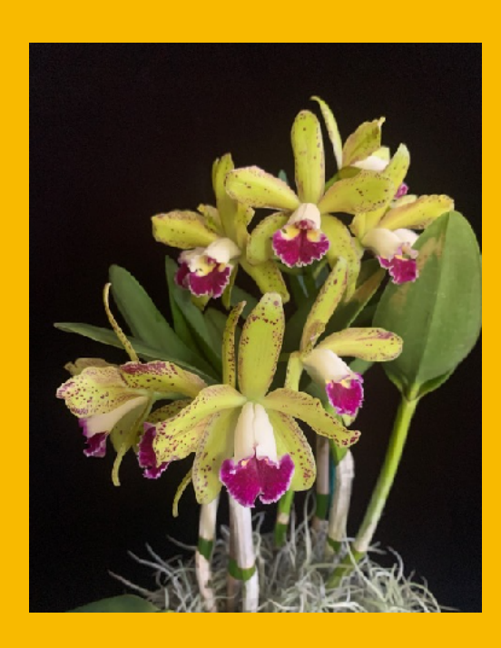
Blc. San Diego Hot Spots 'Frosty'

Snacks & Refreshments This month, all members with last names beginning A through L will share at break time! We appreciate everyone's effort in supplying our meeting with goodies. It makes for a great meeting all around!