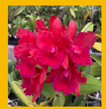
Pot. Chocoberry Fondue