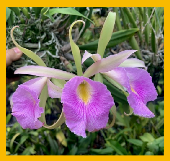
Pcv. Grove Morning 'A'