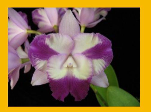
Lctna. Sacramento Splash

billtcwong@att.net or anadzan@mac.com. We look forward to seeing you 9/4 at 4PM.