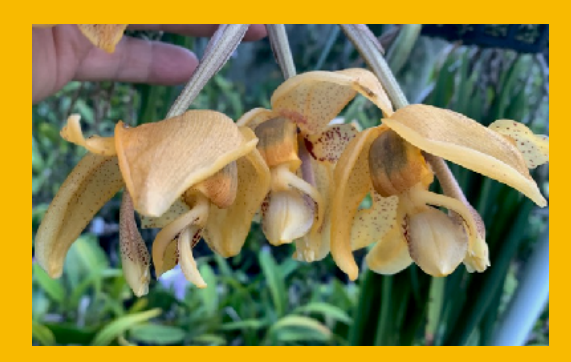
Acopea Celie Myers